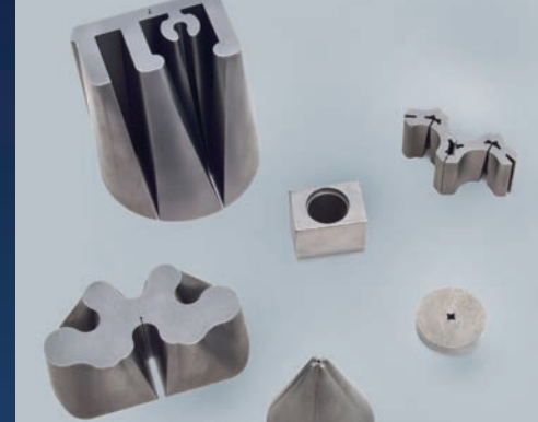
Dies & Tooling