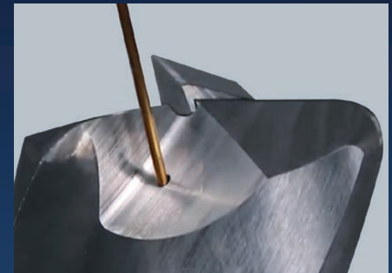
Coolant holes in Cutting Tools